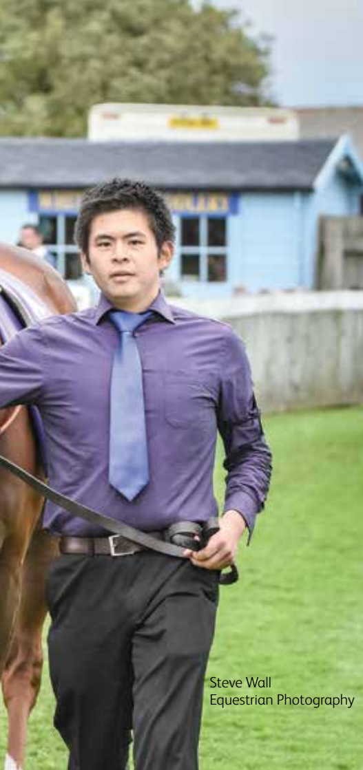
Steve Wall Equestrian Photography