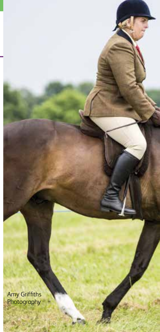
Amy Griffiths Photography

The grass gallop is situated inside the oval all-weather gallop. A set of 10 bay starting stalls and regulation hurdles and steeplechase fences are available adjacent to the grass gallop. The area within the oval gallop is situated in a beautiful setting surrounded by trees, 25 acres of flat, mown grass for rings. Stone access road making it easily accessible. Ideal facility for summer shows, competitions and tournaments.